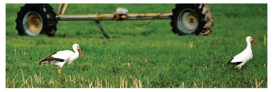
Figure 1. White Storks Ciconia ciconia on irrigated fields in the middle of the desert, Sarir, Libya, 29 January 2011 (Essam Bourass)

Cigognes blanches Ciconia ciconia dans des champs irrigués au milieu du désert, Sarir, Libye, 29 janvier 2011 (Essam Bourass)